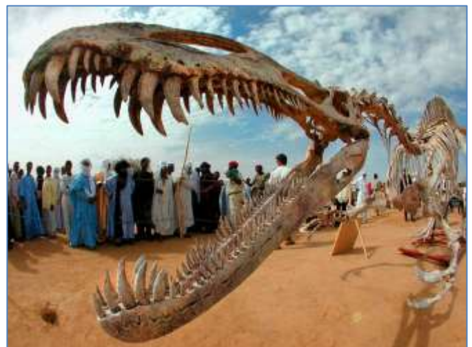
Suchomimus skeleton in Agadez