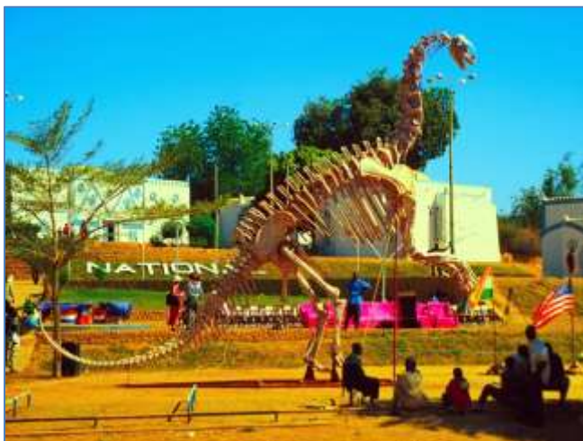
Jobaria skeleton in Niamey

These two had to keep an eye out for the world’s largest croc, dubbed “SuperCroc,” a 12 m (40 foot) long crocodile that prowled the rivers. These are but a few of the paleontological treasures unearthed in Niger and waiting for proper display.