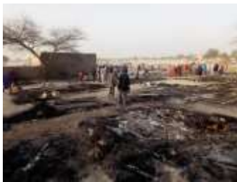
Offices of Doctors Without Borders burned in Maine Soroa, April 2019

http://www.friendsofniger.org/support-for-relief-efforts-in-eastern-niger-with-kirker-foundation-of-niger-may-2019