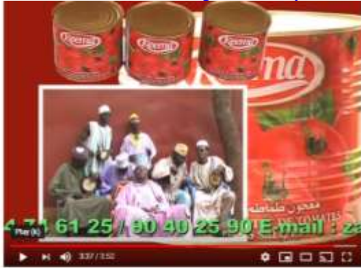
Tomate keema version Zarma

Hausa version - https://www.youtube.com/watch?v=bNW781tsr9w