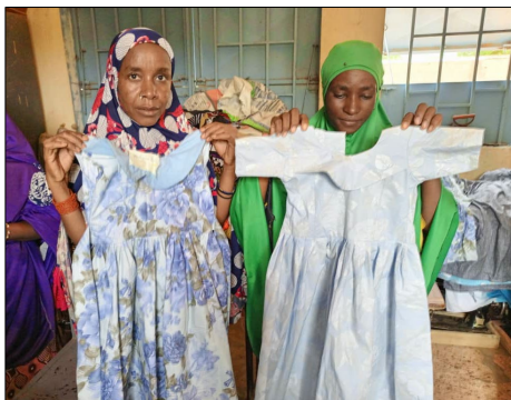
Advanced dressmaking skills gained

All participants returned home with new skills to allow them to set themselves up in business and give them financial independence. FON conveyed additional funding provided by the Jane Huser Maxwell assuring that each participant received a sewing machine to take home.