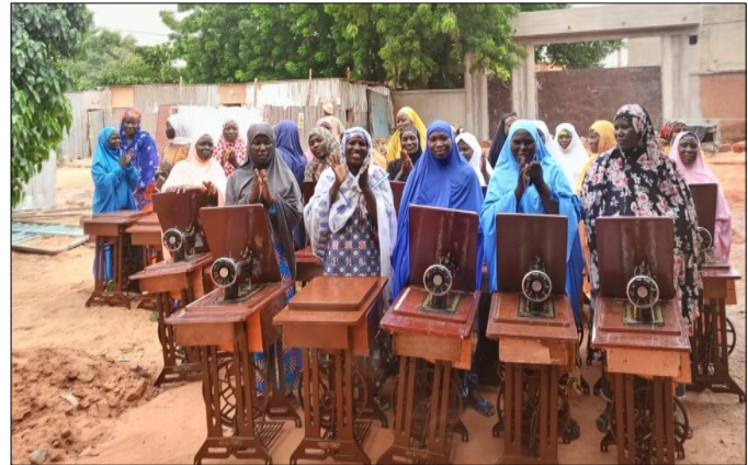
Trained seamstresses with their new sewing machines

In Niamey, a group of 30 recovering fistula patients were provided in-depth training in sewing.