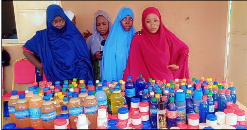
Hamdallaye women display soap and incense products

Training in making soap and incense was provided to more than 30 rural women in Hamdallaye. By the end of the two-week training, several of the women were already planning to purchase raw materials and supplies to allow them to begin manufacturing and selling in the local market.