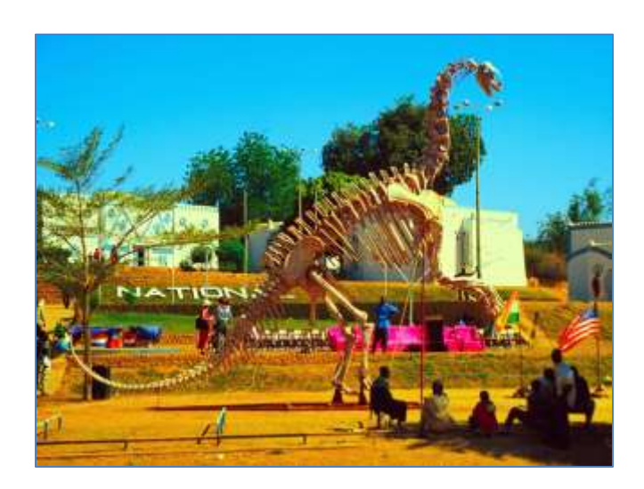
Jobaria skeleton in Niamey

sickle-clawed spinosaurid dinosaurs. These two had to keep an eye out for the world's largest croc, dubbed "SuperCroc," a 12 m (40 foot) long crocodile that prowled the rivers. These are but a few of the paleontological treasures unearthed in Niger and waiting for proper display.