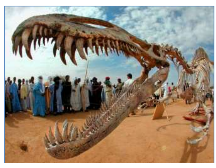
Suchomimus skeleton in Agadez