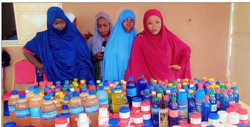
Hamdallaye women display soap and incense products

Training in making soap and incense was provided to more than 30 rural women in Hamdallaye. By the end of the two-week training, several of the women were already planning to purchase raw materials and supplies to allow them to begin manufacturing and selling in the local market.