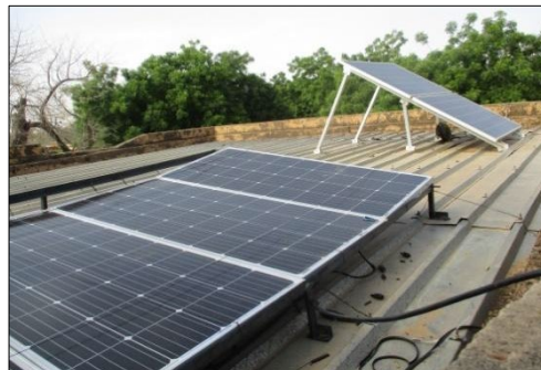
Solar panels – Yekoua Health Clinic

In the Agadez region, a remote health center serving 3,500 families set up a solar pump and piped water system to ensure the availability of clean water. Near Maradi, solar panels were installed on the Yekoua health clinic, providing 24-hour lighting for births and refrigeration of medicine. The project was made possible with matching funds from African Borderland Community Development Fund at Northeastern University facilitated by Bill Miles.