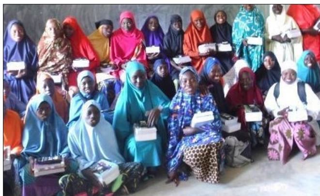
Maradi area girls mentoring project

An innovative program employing older girls as mentors has provided school fees, supplies, and crucial mentoring to encourage more than 100 teenage and pre-teen girls in the Maradi region to stay in school and avoid early marriage.