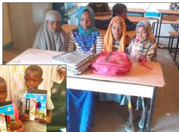
Desks and school supplies