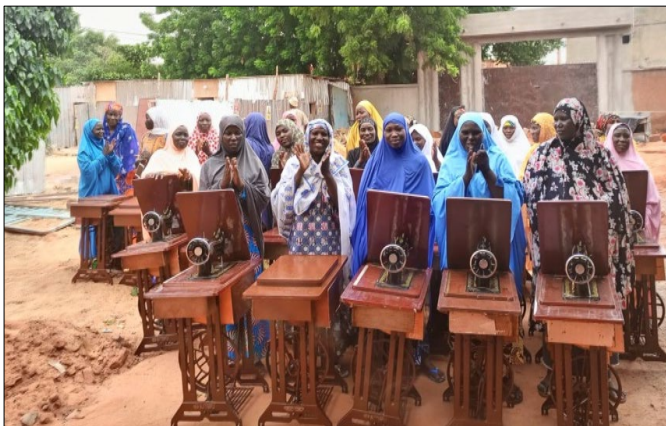
Trained seamstresses with their new sewing machines

All participants returned home with new skills to allow them to meet their basic needs. With additional funding provided by the Jane Huser Maxwell Fund and administered by FON, the women each received a sewing machine to take home.