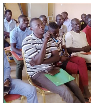
Conflict resolution training

A series of trainings, meetings and community engagement activities targeted women and young community leaders in the Makalondi area which has been experiencing social pressure and conflict from terrorist activity.