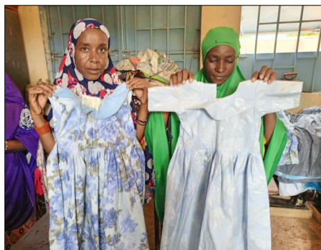
Showing off new dressmaking skills

In Niamey, a group of 30 recovering fistula patients were provided in-depth training in sewing.