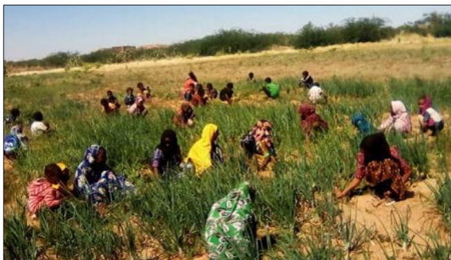
School gardens: education and nutrition

In Agadez, school gardens were developed and improved in two communities benefitting 270 students and their families. Grants in Tillabéri and Agadez provided basic school supplies and desks that show students that their efforts are important. In Aguié, latrines were built for middle schoolers to encourage attendance and promote hygiene.