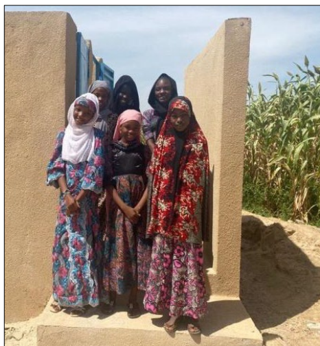
Middle school girls welcome new latrines

In Agadez, school gardens were developed and improved in two communities benefitting 270 students and their families. Grants in Tillabéri and Agadez provided basic school supplies and desks that show students that their efforts are important. In Aguié, latrines were built for middle schoolers to encourage attendance and promote hygiene.